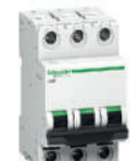
Mcb 3 pole