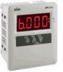
Digital Panel Meter