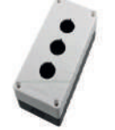
Three way box