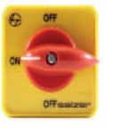
Rotary Switch on/off