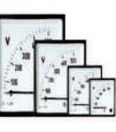
Analog Panel Meter