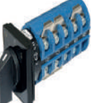
AC Rotary Switch