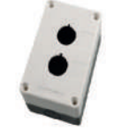
Two way box