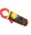
Clamp Multi Meter