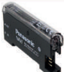
Fiber Optic Sensor