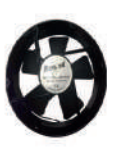
Round Ac Axial Fan