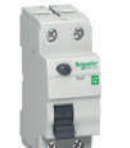
Rccb 2 pole