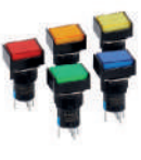
Square Push button