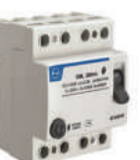
Elcb 4 pole