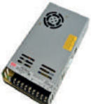
LRS Series SMPS