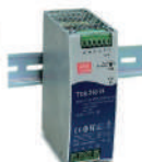
TDR Series SMPS