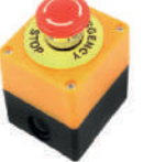
Emergency switch Box