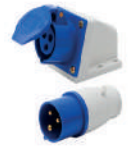
3pin Indus Socket