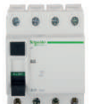
Rccb 4 Pole