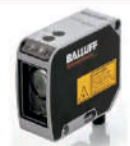
Long Distance Sensor