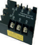
3 Phase SSR