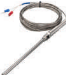
K type Thermocouple