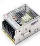
G3 Series SMPS