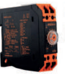
On Delay Timer