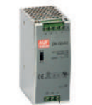
DR Series SMPS