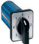
Position Rotary Switch