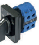
3way Rotary Switch